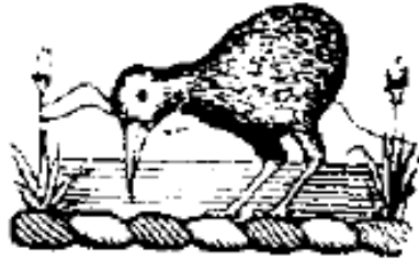
Figure 1: Trade Mark Registration No 2821