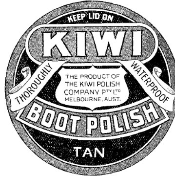
Figure 3: Amended Trade Mark Application

Polish a concurrent registration for an amended mark, as shown in Figure 3 below, on the basis that there were special circumstances. 105