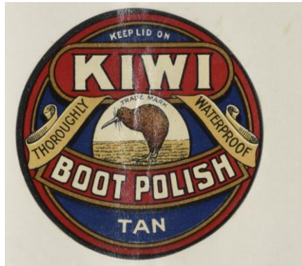
Figure 2: Trade Mark Application No 16773

Kiwi Polish argued that KPC lacked a bona fide intention to use the mark and had not made bona fide use of it. Kiwi Polish also, in the alternative, applied for an order that its own trade mark comprising an image of a kiwi and the words "Boot Polish" and "Tan" for boot polish should be registered on the grounds that there were special circumstances making it proper that its mark be registered. Kiwi Polish had registered its trade mark in 28 countries around the world. It had not used its trade mark in New Zealand, but it argued that its boot polish under the name "KIWI" was well known in New Zealand and distinguished its product, and that it received numerous enquiries for such polish in New Zealand.