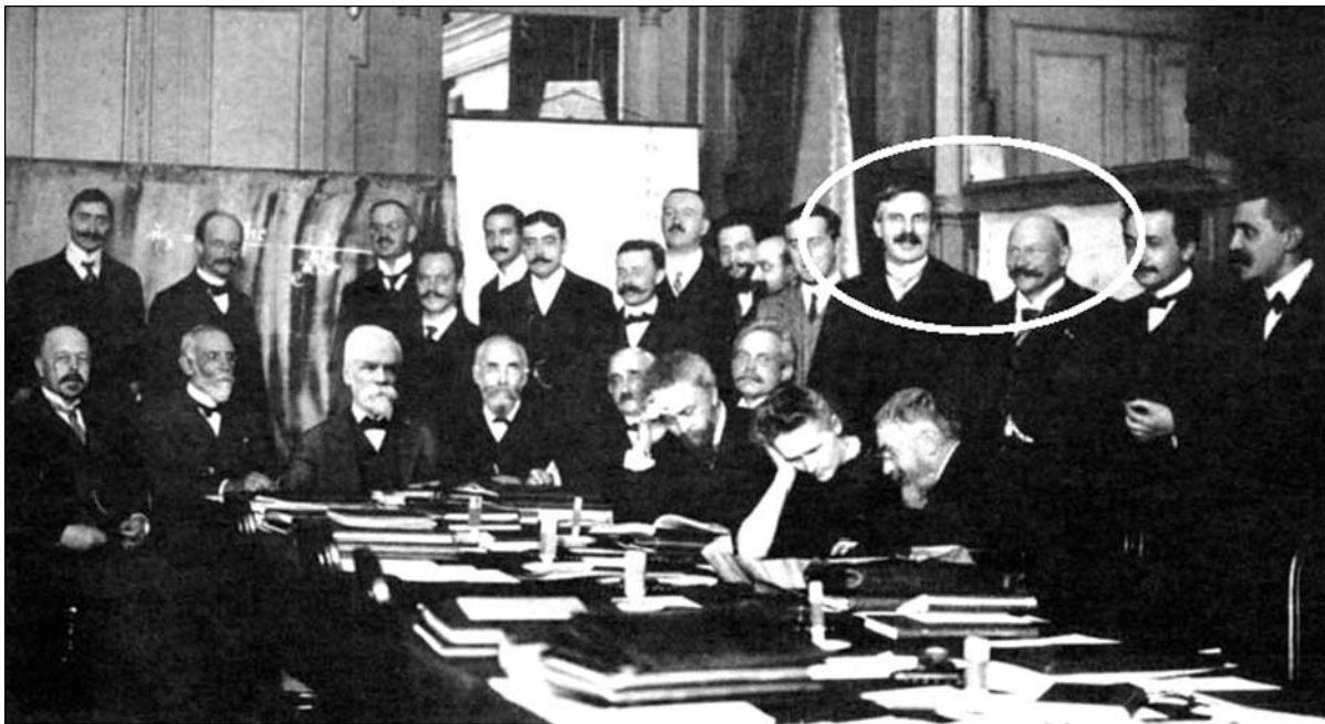
Figure 2. Members of the Solvay Conference of 1911 drawn together to discuss the emerging quantum mechanics of the day. Rutherford and Kamerlingh-Onnes (circled) are seen standing side by side, perhaps for the only time in their research careers. Einstein is immediately to their left.

Figure 2 shows the well-known picture of some of the world's greatest scientists of the time at the Solvay Conference of 1911. Next to Rutherford stands Kamerlingh-Onnes. As far as we know they never corresponded and never collaborated, but for a moment in a photograph they stand together. They are nonetheless forever linked by the helium atom, which they each used as a tool in totally different ways to achieve their ground-breaking discoveries. For Kamerlingh-Onnes it was to be the discovery of superconductivity in 1911, and it is superconductivity that now provides the ongoing link between the legacies of these two great scientists.