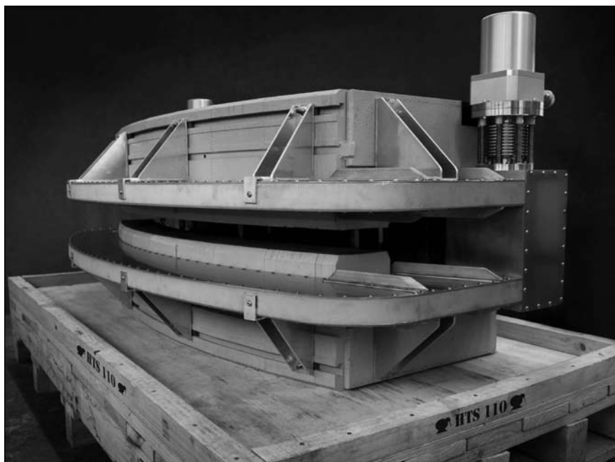
Figure 3. A dipole magnet for the Brookhaven National Laboratory synchrotron, with retro-fitted HTS superconducting coils manufactured by HTS-110 Ltd. The coils are conduction-cooled using refrigerators seen at each end. Neither liquid helium nor liquid nitrogen is used as a cryogen.

It took 16 years to secure the US and European patents and we eventually spun out two companies for manufacturing HTS products. One of these, HTS-110 Ltd 10 , is manufacturing magnets, coils and whole systems such as NMR for the scientific, oil, electronics, health and energy markets. In the last year or so they have completed a 5 T (tesla) magnet for neutron scattering at the Australian Nuclear Science and Technology Organisation, Sydney, a 5.4 T magnet for x-ray scattering at the Hahn-Meitner Institute, Berlin, and a retro-fitted dipole magnet for the synchrotron at Brookhaven National Laboratory (Figure 3). The company now offers magnets up to 16 T and is currently designing for the 19 T range. With the advent of a second-