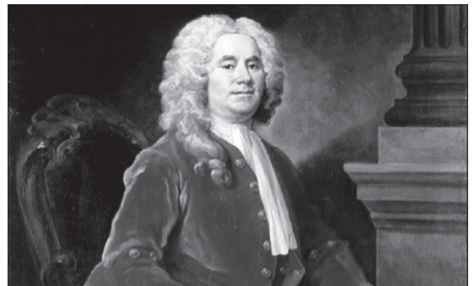
Maths pioneer, William Jones.

In the pages of his Synopsis , Jones also showed his familiarity with the notion of an infinite series and how it could help calculate pi far more accurately than was possible just by drawing