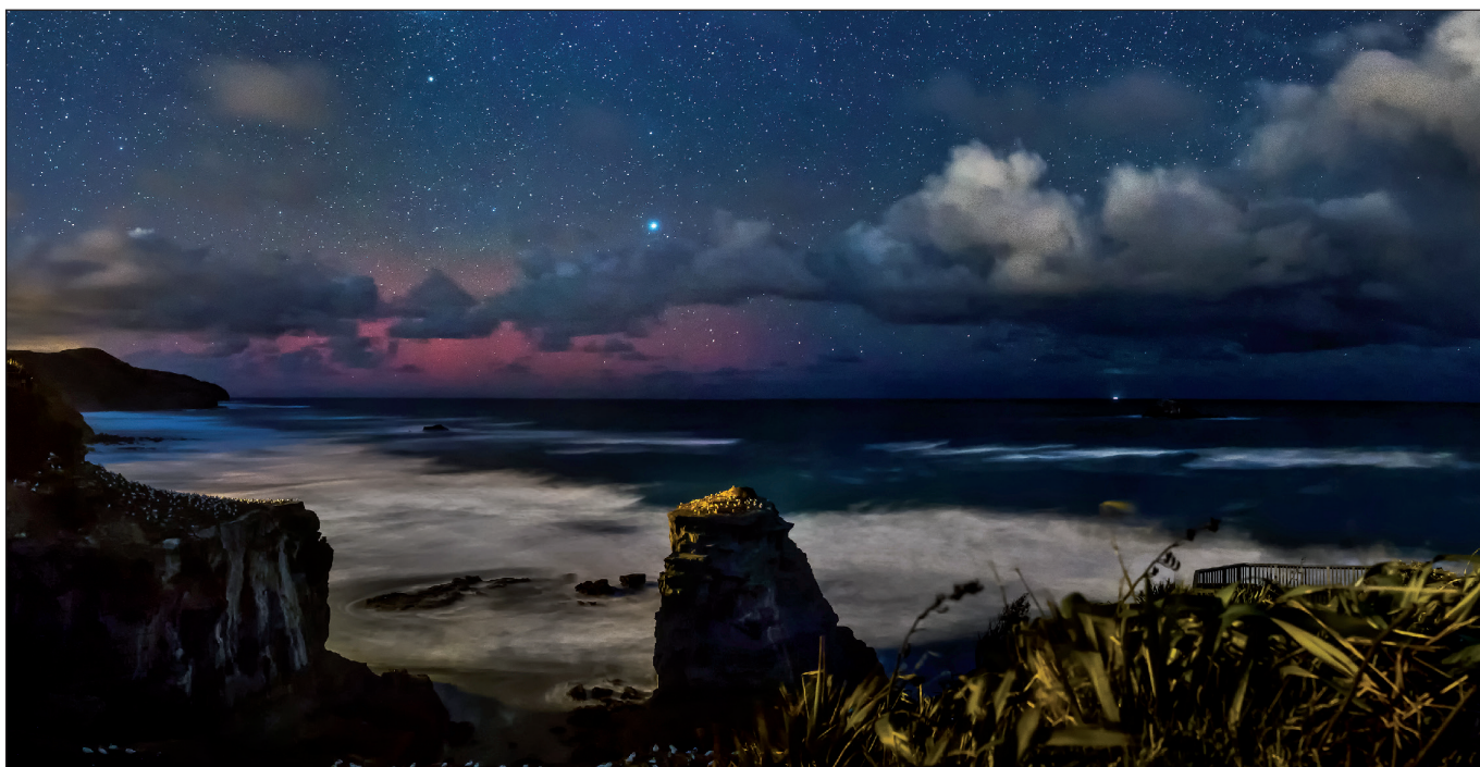
Figure 1. New Zealand coastline at Muriwai. Recent observations, including some made from New Zealand which are described below, have shown that approximately one in five stars like those shown above host a habitable planet like Earth, and one in two an ice-giant planet like Neptune.

the present time were found by the high magnification technique (Shvartzvald et al. 2016).