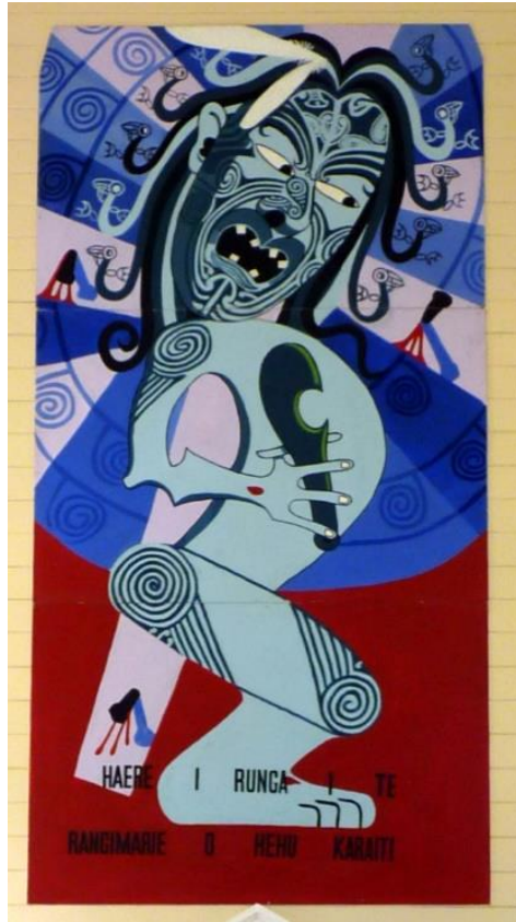
Figure 7. Jesus as Māori Warrior , Hato Hōhepa, Hiruharama, Whanganui, New Zealand. 32