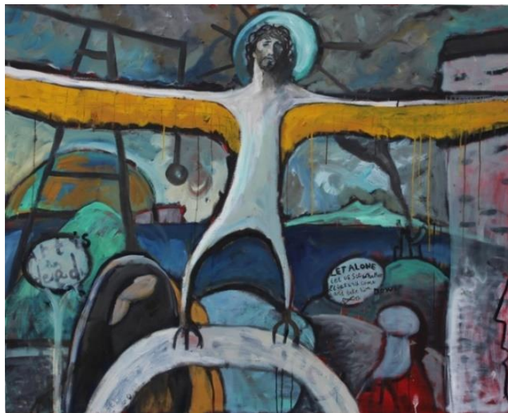
Figure 6. Brett a’Court, Manu-Kahu , 2007. 30

In Manu-Kahu (figure 6), Christian-Pākehā New Zealand artist Brett a’Court depicted a Christ figure as te kāhu , a native New Zealand bird associated with spiritual connections to the divine in Te Ao Māori. 29 As an intercultural artwork that exhibits cross cultural learning and connectedness, Manu-Kahu illustrates an example of Christian and Māori intercultural art.