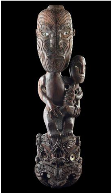
Figure 4. Tekoteko (gable figure) an Ariki Tapairu, c. 1890. 24

In John Stuart's crayon and digital "Stushie Art" titled Kingitanga: Christ on the Cross (figure 5), the subject matter is Jesus as a crucified tāne . This subject matter informs the artwork's religious bearing. The pictorial contents are kirituhi , Māori skin art as opposed to moko mataora , patterning, a crucified figure with a crown of thorns. The colours red, black, and white also comprise part of the contents. They underscore traditional Māori motifs as the national colours of Māori. 25