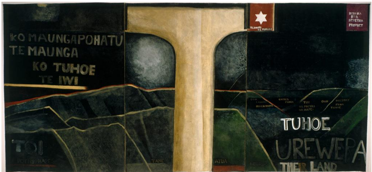
Figure 3. Colin McCahon, Urewera Mural , 1975. Synthetic polymer paint on three unstretched canvases, each 2158 x 182 mm; overall 2158 x 5460 mm. Department of Conservation Te Papa Atawhai and Tūhoe Te Uru Taumatua.