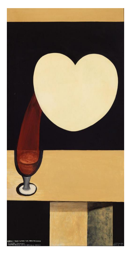
Figure 6. Colin McCahon, Visible Mysteries no. 4 , 1968. Synthetic polymer paint on hardboard. Private collection.