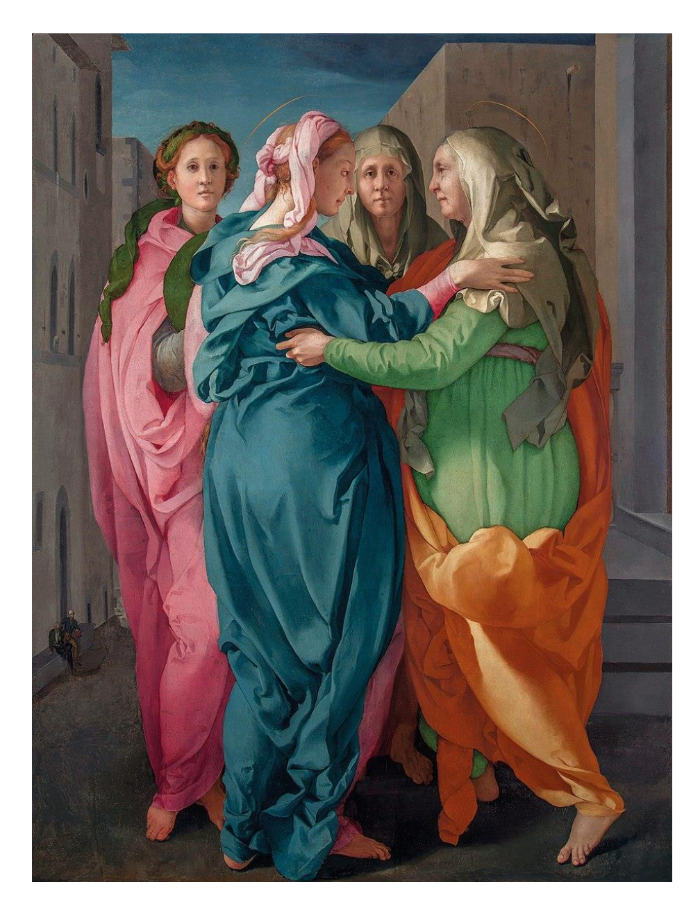
Figure 1. Pontormo, Visitation , 1528–29. Oil on panel. Church of San Michele and San Francesco, Carmignano.

The painting centres on a moment or moments before the birth of Christ, what the Catholic doctrine calls the Advent. It centres, we might say, on the birth of the birth. It is a scene that has been perhaps of interest more to painters than it has to theologians. As a scene in painting it is referred to as a "visitation"; it is also a moment of extreme emotion, surprise, even strangeness when compared to the moments before and after it: the Annunciation and the actual Nativity. Here is the moment: after having received the angel of the Annunciation herself, Mary learns that her cousin Elizabeth has fallen pregnant in a way that her advanced age seemed to prohibit. And already at her own second month of pregnancy Mary visits Elizabeth.<sup>4</sup> No impetus or cause for this visit is given; perhaps it is just the desire to share a common state, to pass on practical knowledge, or to reaffirm by duplication the nature of the miracle involved in both cases. The word "visitation" (visitatio) in ecclesiastical Latin is, however, not a simple visit: it represents a practice to realise, to examine and prove, or allow something to be proven.<sup>5</sup> A sort of pregnancy test, one might say.