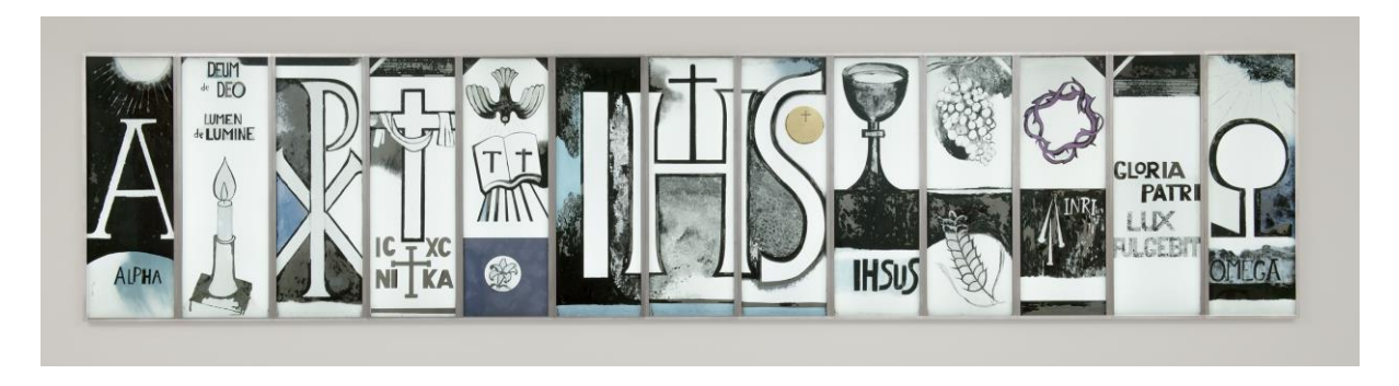
Figure 5. Detail, Colin McCahon and Richard Killeen, [East Window: Convent Chapel of the Sisters of our Lady of the Missions, Auckland], 1965–66. Alkyd on glass. Auckland Art Gallery Toi o Tāmaki, gift of the Chapel of the Sisters of Our Lady of the Missions, Auckland.