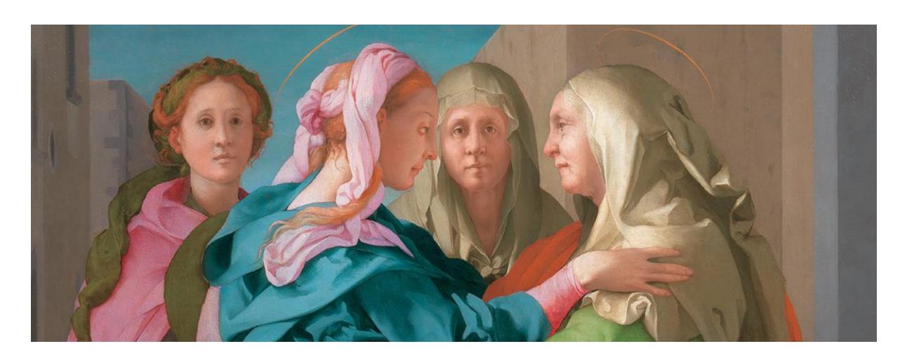
Figure 2. Detail, Pontormo, Visitation , 1528–29. Oil on panel. Church of San Michele and San Francesco, Carmignano.