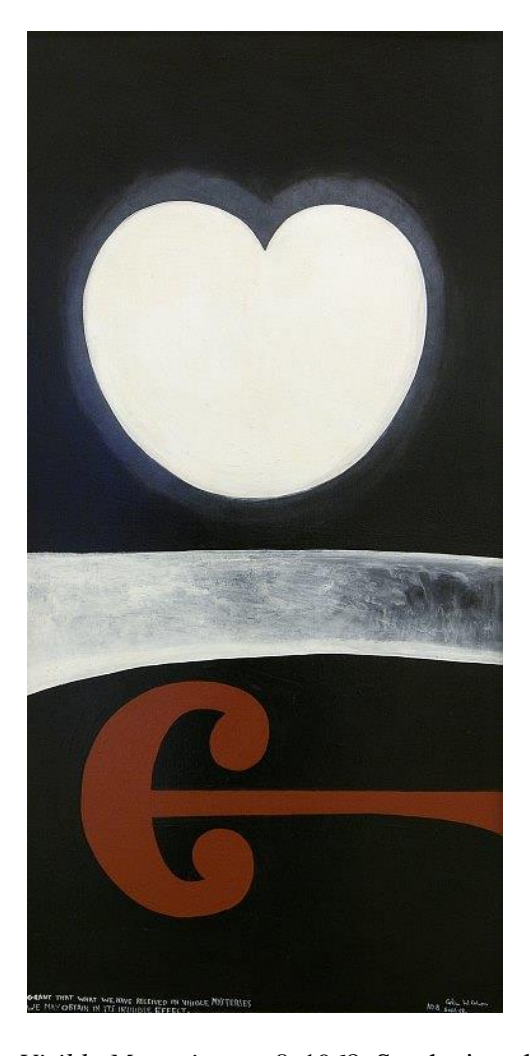
Figure 4. Colin McCahon, Visible Mysteries no. 8, 1968. Synthetic polymer paint on hardboard. Chartwell Collection, Auckland Art Gallery Toi o Tāmaki.

These are works that are undoubtedly influenced by McCahon's long engagement with the Catholic Church, and directly follow a commission he completed for stained glass windows at the Convent of Our Lady of the Missions, Remuera, a commission during which McCahon engaged in extensive dialogue with the then Archbishop Liston about certain doctrines of the Catholic Church. The now detached main convent east window has been restored and has just been on exhibition in the Auckland Art Gallery. Panels 9—a chalice of wine and the name in Greek for Jesus IHSUS—and 10—wheat and grapes indicating symbolically the Holy Communion (bread and wine)—refer to the transubstantiation of the body of Christ mentioned a moment ago and which is, of course, one of the rituals that distinguish the Catholic Church from the Protestant Church. It is the mystery of the Incarnation as represented in the ceremony of the Holy Communion during church service, in which parishioners drink what is said to be Christ's blood and eat bread as Christ's flesh. It is undoubtedly as some kind of painterly equivalent to this ceremony that McCahon painted Visible Mysteries . 18