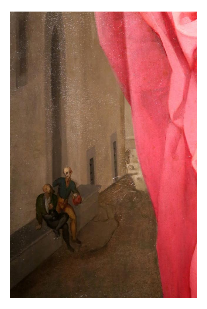
Figure 3. Detail, Pontormo, Visitation , 1528–29. Oil on panel. Church of San Michele and San Francesco, Carmignano.

We are therefore dealing with a challenge for painting, one of the purest challenges in which it must render visible an invisible message. It must convey how the sense of the invisible can be portrayed in the visible. The question we ask ourselves, as if following the words of Elizabeth, is how do we see the invisible? How does it leap out at us ? Where is its "bump"? And with what joy do we experience this? Pontormo is inviting us to think of a real and hidden presence at the heart of his painting. The mystery of Incarnation and conception perhaps helps explain the very brilliance of the painting, where everything depends upon a superabundance, a supervisibility of phosphorescent colour, as if waiting to burst forth. The brilliance of the painting's colours is its force, a force that would form its substance and yet conceal its mystery, just as the wombs of the two women conceal the fruits of their two mysterious conceptions.