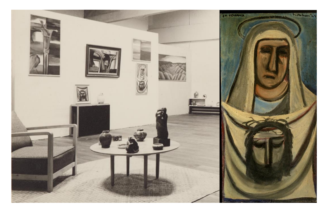
Figures 4-5. Left: detail of photograph by John Ashton, Museum of New Zealand Te Papa Tongarewa, showing Helen Hitchings Gallery, Wellington, 1949. Photograph includes Colin McCahon, Saint Veronica's Handkerchief , 1949. Oil on canvas (leaning on dresser); and Saint Veronica , 1949. Oil on cardboard. Right: Colin McCahon, Saint Veronica , 1949. Oil on cardboard, Auckland Art Gallery (courtesy of the Colin McCahon Research and Publication Trust).