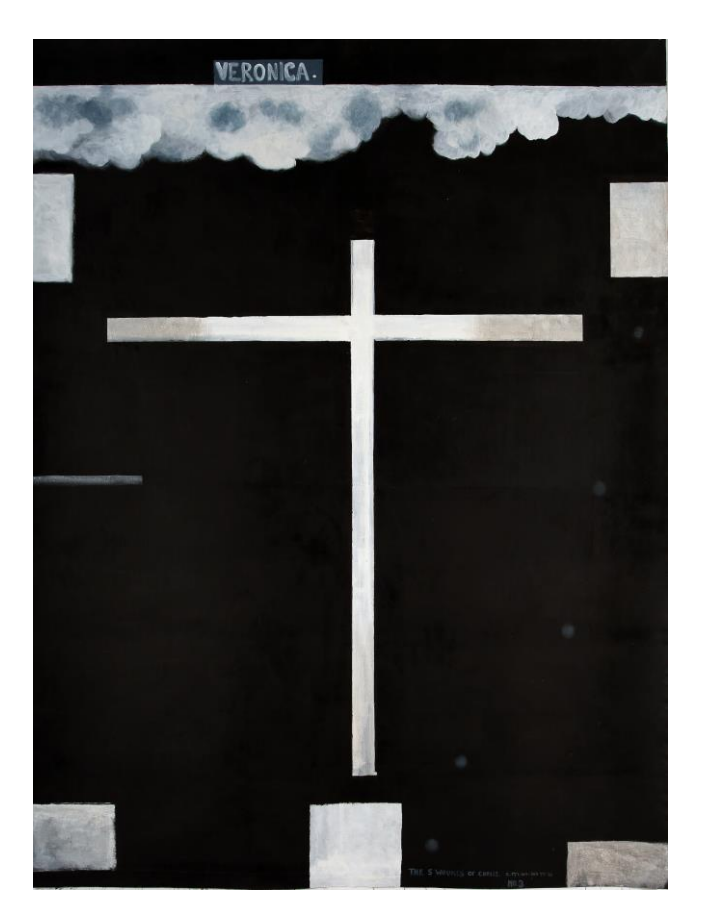
Figure 11. Colin McCahon, The Five Wounds of Christ No. 3: Veronica , 1977–1978. Synthetic polymers on unstretched canvas, Dunedin Public Art Gallery.

Like the stations, the Five Wounds are a form of Catholic devotion, and refer to the wounds in Christ's hands and feet from being nailed to the cross and the wound in his side from being lanced. There are similarities in imagery to the Angels and Bed paintings, the wounds being signified by marks around the periphery of the pictures, either rectangles or short horizontal lines. In The Five Wounds of Christ No. 3: Veronica there are four white rectangles and a horizontal line. The wounds are also signified by a series of white dots, as on rosary beads. In one instance these resulted from the accidental spilling of the artist's own blood, an occurrence which he retained and copied onto the other two works. A striking feature of The Five Wounds of Christ No. 3: Veronica is the band of scalloped white clouds stretching from edge to edge above the cross and below the dark band which carries the title. This has the effect of locating the painting within a landscape and thence within the narrative of the Crucifixion, whatever other symbolic connotations it may possess.