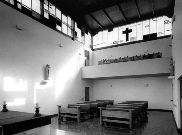
Figures 6-7. Chapel of Our Lady of the Missions, Upland Road, Remuera, 1966.

The method McCahon used was rather rough and untested, simply painting directly on the windows with commercial alkyd paints as used by sign writers. Within a few years the windows began to deteriorate; only the East window survives (in radically conserved state) at Auckland Art Gallery.