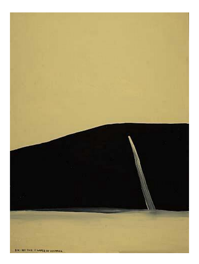
Figure 8. Colin McCahon, The Fourteen Stations of the Cross No. 6: His Face is Wiped by Veronica , 1966. Synthetic polymers on paper on cardboard, Auckland Art Gallery.

Those including lighter colours, "dirty yellow" rather than dark grey, tend to be the warmer, more empathetic, less tragic moments, including No. 6: His Face is Wiped by Veronica . Otherwise it is difficult to establish a precise connection between image and station, beyond the broad emotional parabola of the series.