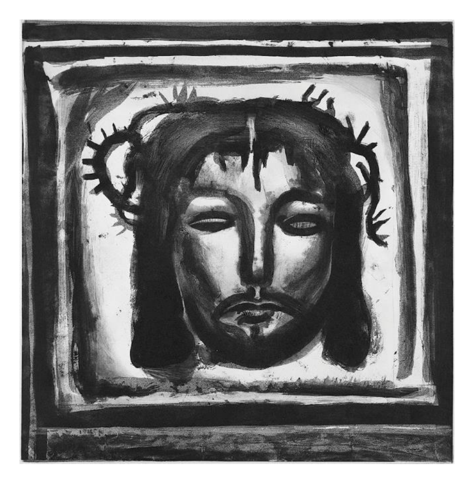
Figure 3. Georges Rouault, Plate 33 from Miserere, 1928. Aquatint.

McCahon's Saint Veronica is less innocent-looking than Rouault's figure. Her face, the features boldly outlined in black, is bleak, tear-stained and grieving, her head surmounted by a white veil and crowned with a simple black halo against a background of dull blue. Half the picture is taken up with the veil and its image. The head of Christ could almost be a death mask; his eyes are closed or downcast; he is full bearded with a crown of thorns. Looping black folds are prominent on the white veil. The depiction points towards a tragic rather than a redemptive or triumphal reading of the Crucifixion and the events leading up to it.