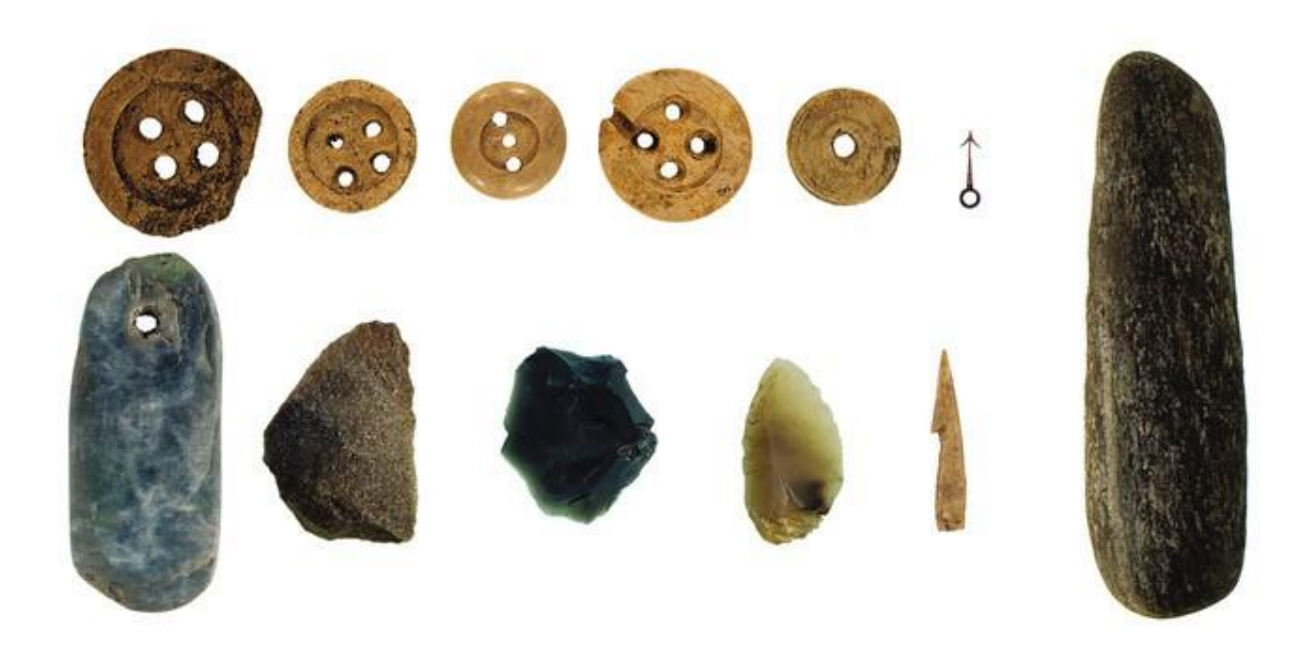
Figure 5: Artefacts from Sealers Bay TOP Bone buttons and a gold watch hand. Until the 1850s, bone buttons were made by hand, leaving many with an irregular shape. From left: University of Otago, CF.142.AB.2, CF.199.AB.6, CF.170.AB.3, CF.199.AB.5, CF.234.AB.7, CF.37.AS.2

and harvesting birds – so that their lives closely resembled their Māori neighbours. As Smith notes, the artefacts found bear "material witness to this integration of Māori and Pākehā cultural traditions" (p140). Māori artefact forms found include stone flakes of food preparation, fish hooks, files, adzes, an awl and a pounamu pendant; those of Pākehā are mostly nails and spikes, with an unusually large number of clay pipes and glass bottles, some plates (no tea cups), and a gold watch-hand.