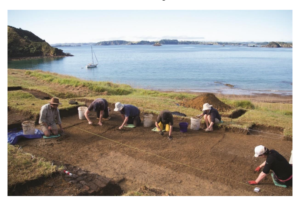
Figure 3: Archaeological excavations at Hohi mission station, the first permanent Pākehā settlement, founded in 1814. Excavation is a careful process of uncovering remains of past human activity by removing accumulated soil layers one at a time so that items recovered can be placed into a sequence of events. In this area of the Hohi site, archaeologists discovered

Historical archaeology attempts to reconcile the distance between two disciplines, and bring two archives into dialogue: one on paper, the other archive preserved in the earth. Its practitioners seek to walk what Ian calls "the borderlands between archaeology, history, and tradition" (p278). Perhaps are as many paths through such disciplinary diversity as there are practitioners. Smith's own has some decisive strengths.