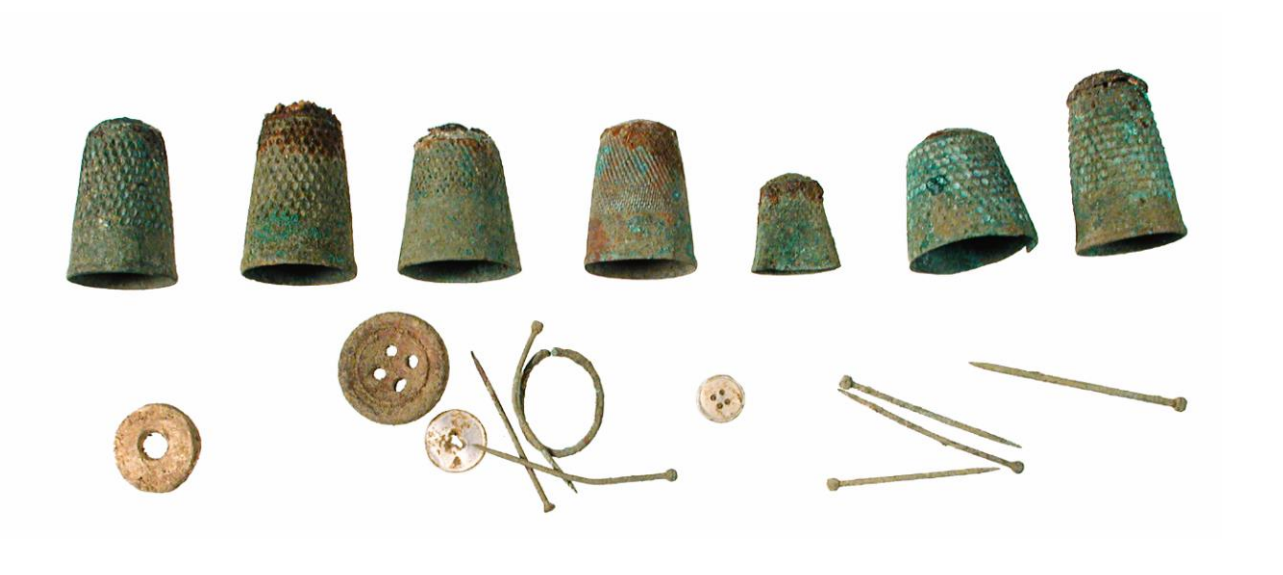
Figure 2: Thimbles, buttons and sewing pins found at the site of the Te Puna mission station, Bay of Islands. *Photographs by Angela Middleton.