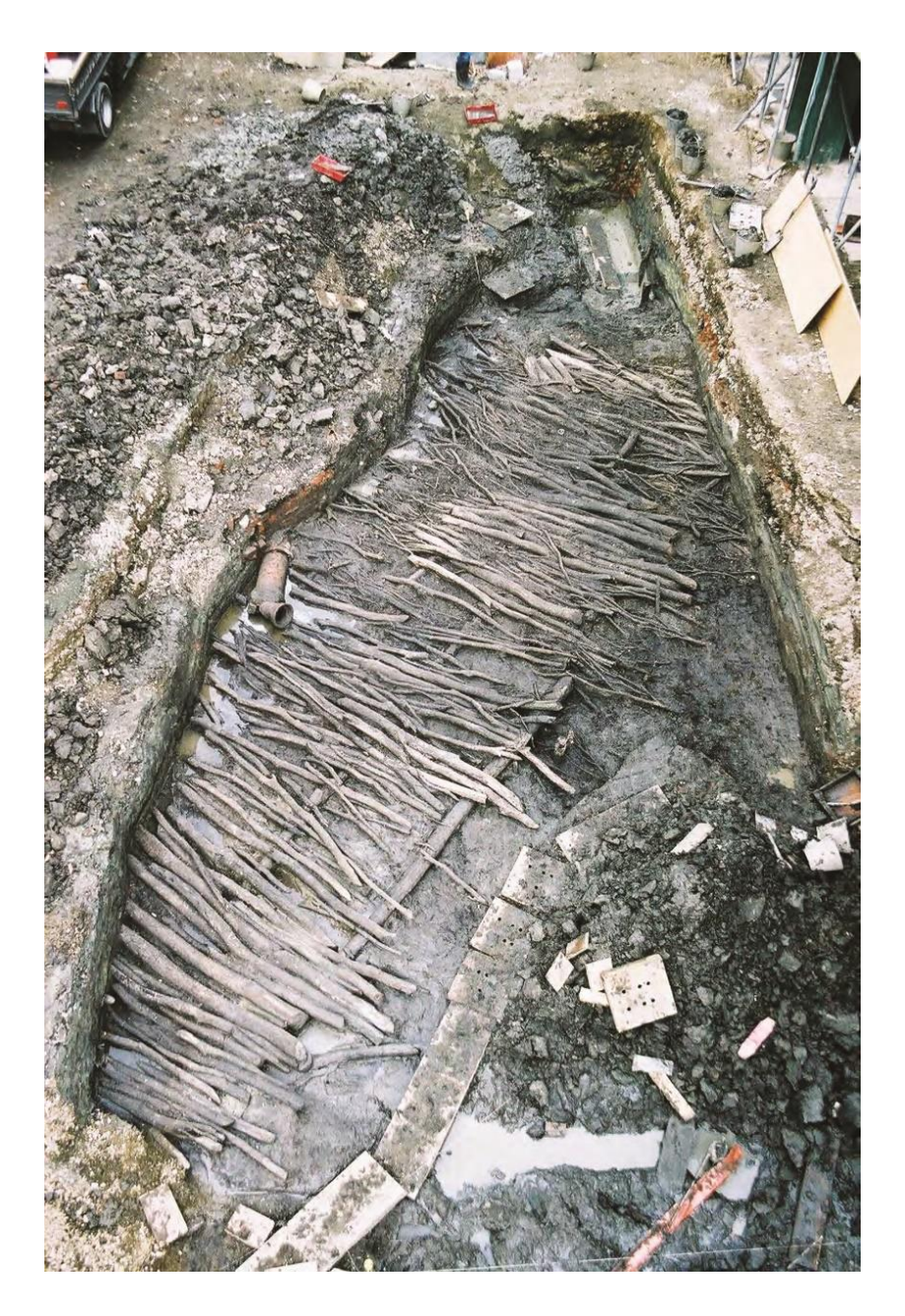
Figure 15: This timber causeway constructed across a boggy streambed in the late 1840s or 1850s was discovered in 2008 during development of the Wall Street mall in Dunedin.

to 1840-60. Sufficient excavations in cities such as Auckland, Wellington and Dunedin have been undertaken for Smith to describe their development in archaeological terms. His analyses of the development of commerce and industry – especially warehouses brickworks, and hotels, and infrastructure such as wharves, water supply, and roads – are especially valuable. The timber causeway shown below, for example, was found just east of Dunedin's main thoroughfare George Street – when laid down, soon after the town's founding, it crossed a mire or stream adjacent to the shoreline. As Smith says, it provides "a stark reminder of the conditions that prompted many locals to call their town 'Mud-edin'" (p241).