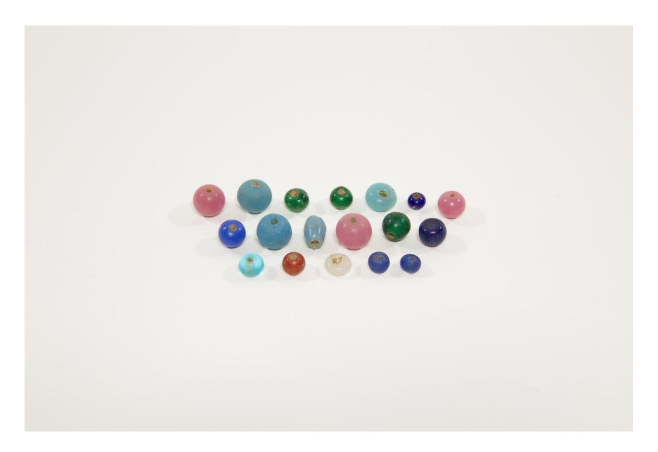
Figure 1: Coloured glass beads from the Hohi mission site. Photographs by Ian Smith.