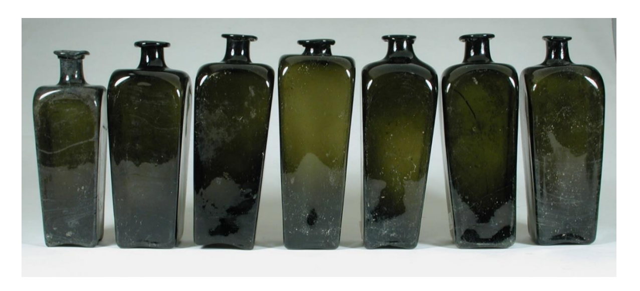
Figure 10: Bottles had to be imported into New Zealand, so they were often reused. These were among thirty gin bottles excavated from the basement of the Te Puna mission house. They were called 'case-gin' bottles because their square cross-section made them easy to fit into a packing case. Photograph by Angela Middleton .

as that at Oashore, a shore whaling station Smith excavated on Banks Peninsula, where the distribution of pipe remains around the buildings suggests even then the smokers had to sit outside; analysis of their pipes also allows inferences about the currents of commercial traffic, such as that from about 1840 "the main source of pipes shifted from New South Wales to Britain" (p180). It allows also for the occasional telling observation: analysis of the crockery found at the General Assembly building that housed our first Parliament showed such a various array of white-ware patterns that "New Zealand's first parliamentarians appear to have supped from a mismatched array of china." (p204).