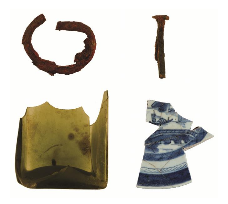
Figure 7: Items from William Cook's shipyard include (from top) an iron chain link, a wrought iron nail, a Canton ware plate fragment, and a section of a square glass bottle. It is likely that the Canton ware crockery had been brought south from the Bay of Islands. From top: University of Otago, COC.3.M.2, COC.4.M.15, COC.1.C.1, COC.10.G.11, photographs by Ian Smith.