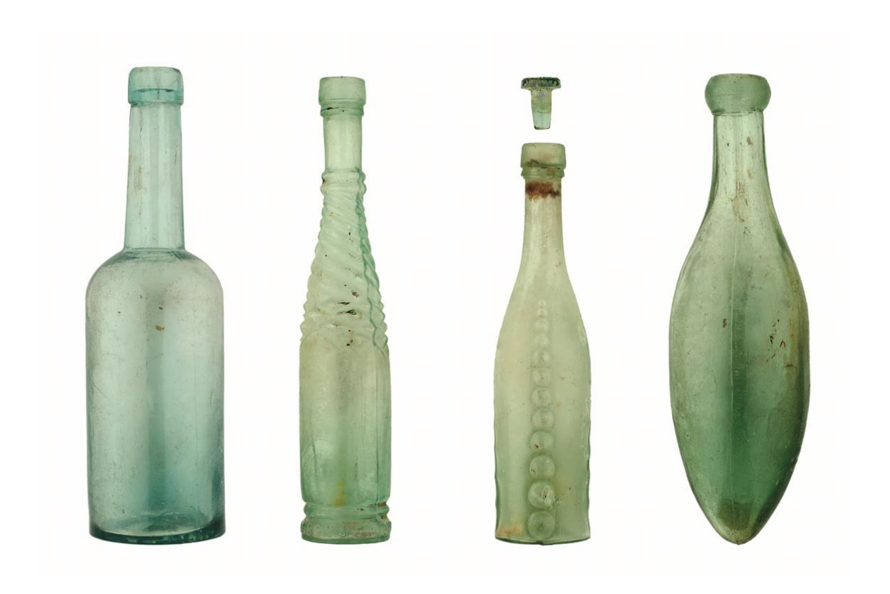
Figure 11: Among the new types of glass bottles brought to New Zealand by colonists in the 1840s were containers for (from left) sauce, salad oil, vinegar and carbonated soft drinks. Salad oil and vinegar bottles had moulded decorations as they were intended to be used at the table. The torpedo-shaped Hamilton's patent bottle (at right) was designed to be stored on its side to prevent the cork from drying out and letting the 'fizz' escape. From left: University of Otago, HA.582, HA.357, HA.772, HA.510, photographs by Les O'Neill.