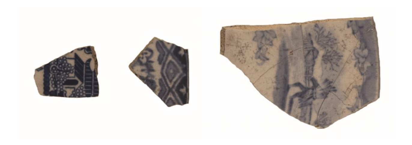
Figure 12: Ceramic fragments from whiteware cups, saucers and plates used by early parliamentarians in the General Assembly building.