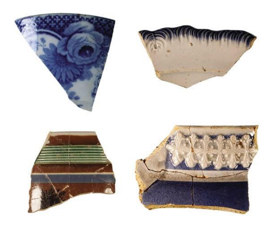
Figure 8: Ceramics from the Hohi mission. Whiteware, which became the dominant ceramic type after the 1820s, was decorated in a range of different ways. At Hohi these included (clockwise from top left) transfer printing, shell-edging, sprigging and industrial slip. Clockwise from top left: University of Otago, HM.WW.25, HM.SH.4, HM.SPR.1, OM.IS.1, photographs by Jessie Garland.