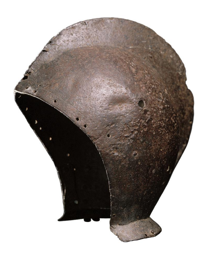
Figure 4: The iron helmet recovered from Wellington Harbour some time before 1904. It is likely to have been manufactured in the late sixteenth-century but had not been immersed in seawater for long when it was found. Museum of New Zealand Te Papa Tongarewa , ME000841 .

Smith prefaces his discussion of early exploration with an enjoyably rapid-fire demolition of the proposition Portugese or Spanish onshore arrivals pre-date Cook. Those already-converted are probably hopeless causes, but Smith incisively undermines any reasonable faith in 'mystery objects' finds such as an iron helmet recovered from Wellington Harbour. All such objects are effectively meaningless, because they lack provenance – "information about the location and context in which an item was found" (p44).