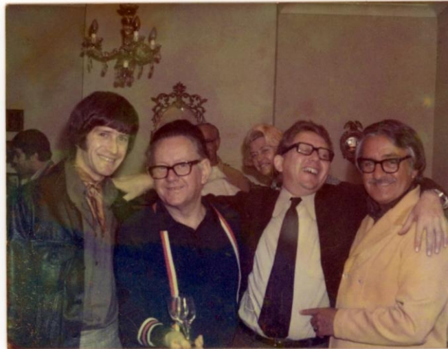
[Figure 3: A 1960s gay house party in either Wellington or Auckland, complete with tasteful decorations. Author’s collection]

The crew-cut young man by the table steadies himself.... He is wearing tight beige shorts cut as briefly as possible, with white sox between scuffs and nicely shaped calves—all the better to show up the deep tan of his legs which it has to be admitted are very attractive legs, a fact always noticed by the Group.