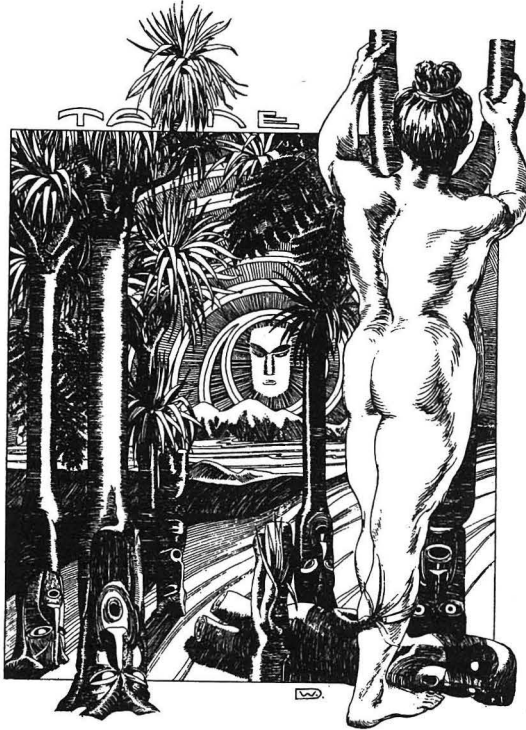
Cabbage trees are extremely important 'pro-life' images to Māori. W. Dittmer 'The creation of nature' in Te Tohunga, 1907.

drought, flooding, fire and harvesting, and their ability to regrow after damage, was recognised. As well, their ability to grow out in the open meant that cabbage trees could be planted successfully by people. The often large size and distinctive appearance made cabbage trees stand out in the landscape. Near the mouth of the Waiapu River at East Cape was a tī kōuka on which the first fish was hung as a tribute to Tangaroa ; it was also a marker of the location of a fishing ground. Another tī kōuka , called ‘ Hereora ’, located the boundary of a food-gathering area ( wakawaka ) of a hapū of Kai Tahu ; today this tree grows in the grounds of Burnside High School in Christchurch . Because they were long-lived, reliable and useful, tī kōuka were seen as life-supporting trees and were often planted at urupā (burial grounds), and sometimes they were iho-whenua (places where the placenta was buried). Such trees were tapu and sometimes figured prominently in the whakapapa of the group. Some of these traditions relate back to values generated in Polynesia . Today, the tropical Pacific tī ( Cordyline fruticosa ) is commonly planted around