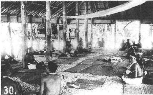
The meeting house in Nukunonu photographed before 1966 when it was destroyed by a hurricane. Elders or family heads are seated against the posts, while younger men sit around the perimeter.

Tokelau gatherings. There were several interesting features of this informality: The elders spoke of their relationship to the villages and to the villagers; General Fono delegates were asked questions about, and answered questions on their role in the General Fono and on the extent to which they reported their activities in the General Fono back to the villages; youth asked elders about the right of youth to participate in the government of Tokelau; women raised questions about gender stereotyping and gender discrimination in village affairs; and senior secondary school children, as the future of Tokelau, participated on an equal basis.