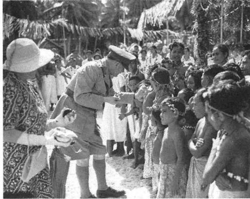
New Zealand Governor General sir Bernard Freyberg's tour of the Tokelau Islands, Nukunonu, July 1948. An accompanying caption reads: 'His Excellency feeding sweets to kids'. Mr Christensen. National Archives.

Will Tokelau meet the year 2000 deadline for decolonisation? In 1994 Tokelau committed itself to the process of development of internal self-government, but has expressly not committed itself to any timetable for achievement of full internal self-government or for the exercise of its right to self-determination. In order to advance the goals of internal self-government, Tokelau has since 1993 been very active. It has brought the Tokelau