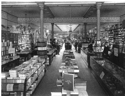
Whitcombe & Tombs, Christchurch in 1919.

It has been long awaited, and, whether we post-colonials like it or not, its existence bestows something of a stamp of approval on a literature we already know is distinctive,