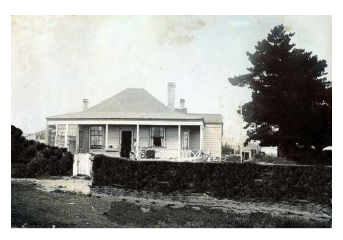
Figure 4. The Howell residence at Riverton, which was built in 1847. This photograph dates to 1907.

It is important to emphasize here that the trajectory of the Howell family from the 1850s was quite distinct from many mixed race families who lacked the access to land, wealth and appropriate social capital. Such families were often living in isolated situations and marginalized from colonial society by the end of the century, reliant on the traditional support networks of their Kāi Tahu whanui for survival. The imprint of these individuals on the historical record is also faint, but petitions to the government from both the fathers of mixed race children and from Kāi Tahu relatives highlight their pitiful state and suggest that tensions existed over increasingly scarce land and resources. The divergent experiences of the mixed race community is reflected in government censuses from 1853, which made a distinction between 'half-castes living as Maori' and 'half-castes living as Europeans', signalling that racial identity was officially constituted and reinforced by behaviour and lifestyle as well as by blood.<sup>49</sup>