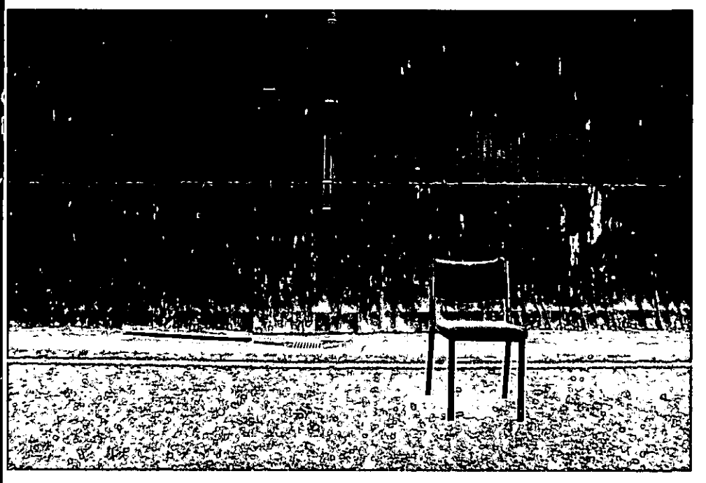
Wellington Kilbirnie Park 01