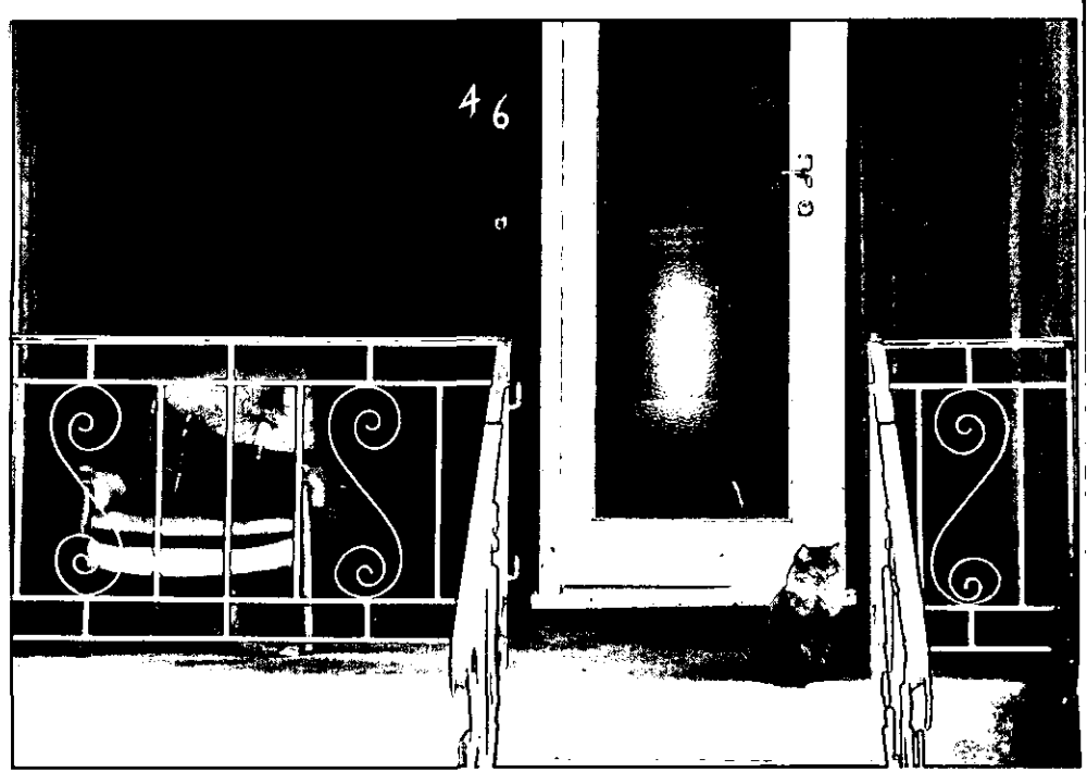
Wellington Moxham 01