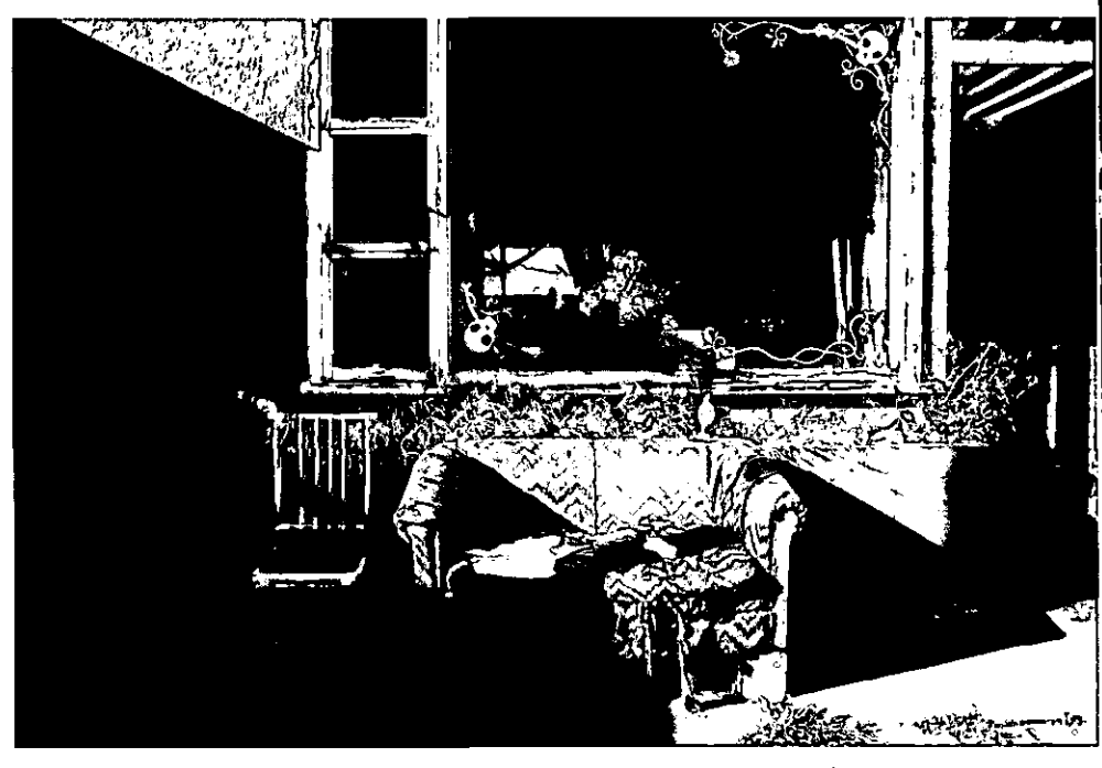
Wellington Oriental Bay 01