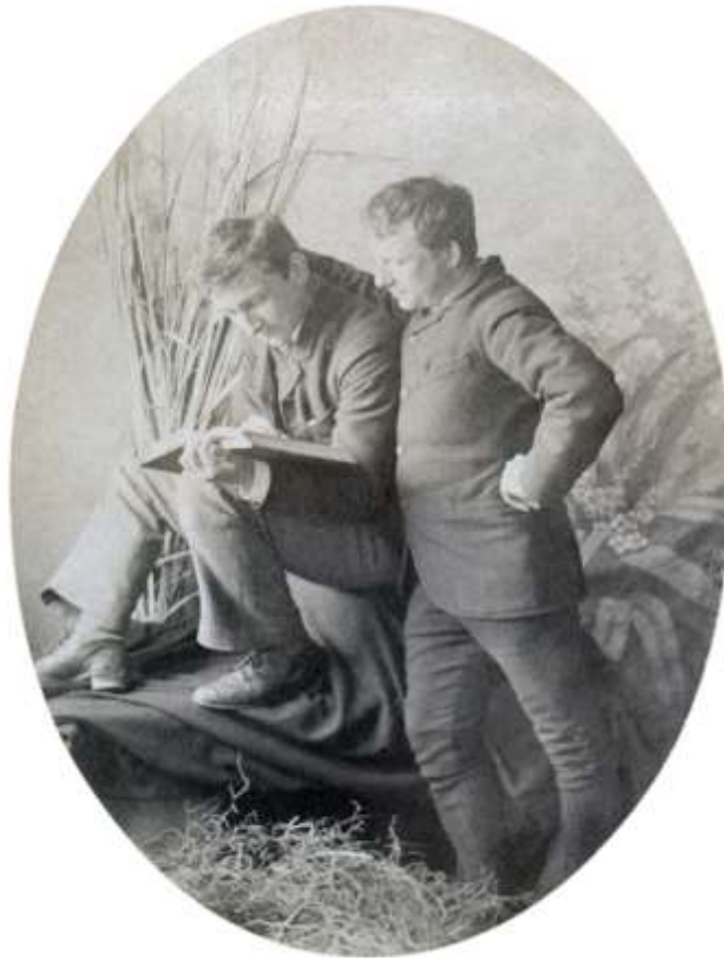
Figure 1: 'Charlie reading', 1889. PA1-q-962-43-2, Alexander Turnbull Library (ATL)

Two men pose together in an oval cut-out (Figure 1). The man on our right stands for the camera and lays his arm against the back of his seated companion. Both ignore the camera and study a book instead, absorbed in the world portrayed in its pages. The pair shares a moment in time, a space, and also an intimate closeness; these are no men alone. What is their story, and what does it tell us about men's lives in late-nineteenth-century New Zealand?