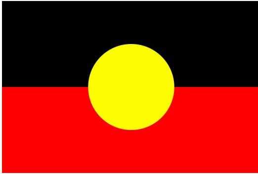
Figure 2. The Australian Aboriginal flag (1971). Colours: black, yellow and red.