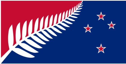
Figure 5. The preferred Silver Fern alternative flag (2015). Colours: black, royal blue, white and red.

In the end, the first referendum on the New Zealand flag, which took place in December 2015, asked the question: 'If the New Zealand flag changes, which flag would you prefer?' The turnout was 48.78% of those eligible to vote; the result, which was announced by the Electoral Commission on 15 December, was that the most preferred alternative flag design was the Silver Fern (the Black, White and Blue version), designed by Kyle Lockwood (Figure 5).