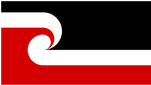
Figure 3. The Tino Rangatiratanga flag (1990). Colours: black, white and red.

In January 2009, the Hon. Pita Sharples, then Minister of Māori Affairs, called for a Māori flag to be flown from Auckland Harbour Bridge on Waitangi Day. The Rt. Hon. John Key, as prime minister, responded by saying that he would support two flags flying if agreement could be reached on a preferred Māori flag. Following hui in July and August of that year at which four flags were considered – the New Zealand flag, the New Zealand Red Ensign (which is the same as the New Zealand flag, but with a red background), Te Whakaminenga (the United Tribes) flag (Figure 1), and the Tino Rangatiratanga flag (Figure 3) – the Tino Rangatiratanga flag was chosen for the task. The choice