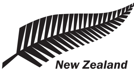
Figure 6. Brand New Zealand. Colours: black and white.

The stylised version of the silver fern was prime minister John Key's preference for the new national flag, and it is perhaps no accident that three of the final four (or five) designs for the new flag comprised variations of the silver fern. These stylised versions, however, reflect more of a motif than a standard, more of a brand than a banner (as epitomised in Figure 6), and, indeed, given John Key's personal support for the fern, a number of commentators referred to the flag referendum as more about 'Brand Key'.