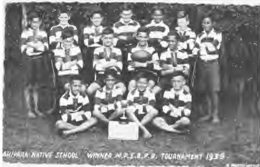
Ahipara Native School 1936