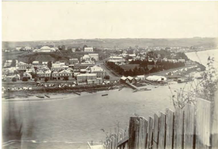
Whanganui iwi tents and waka on the river foreshore, Whanganui town, circa 1880s.