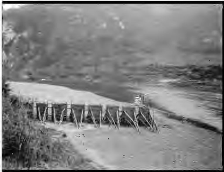
Eel or fish weir at Pungarehu, on the banks of the Whanganui River. Whole-plate collodion silver glass negative. Ref. 1/1-000483-G.