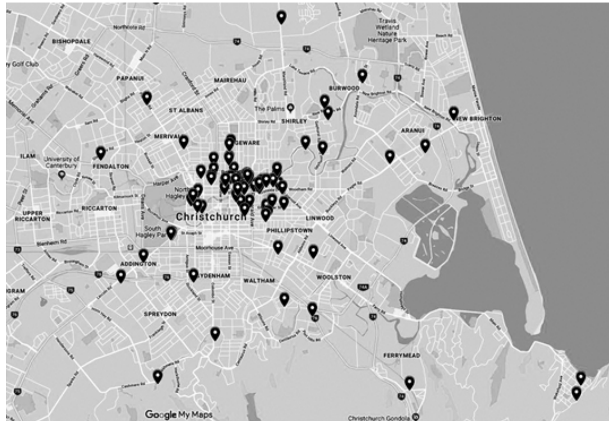
Figure 1: The location of the houses in the sample.

The houses we build reflect not just who we are and what we believe in, but also the social, cultural and economic context within which we live. 1 When a house is broken down into its individual components, and these components are compared with the predominant trends of the day, more can be learnt about the person who built the house, through the choices they made about what their house was built from, where it was built, its layout and its appearance. But before such interpretations can be made, there needs to be a good baseline of data that establishes what the major trends of any given period were, in the appropriate location. To this end, while my doctoral research is concerned with how Christchurch's nineteenth-century residents constructed their identity through their houses, it is first necessary to understand what the most common elements of houses were in nineteenth-century Christchurch. This