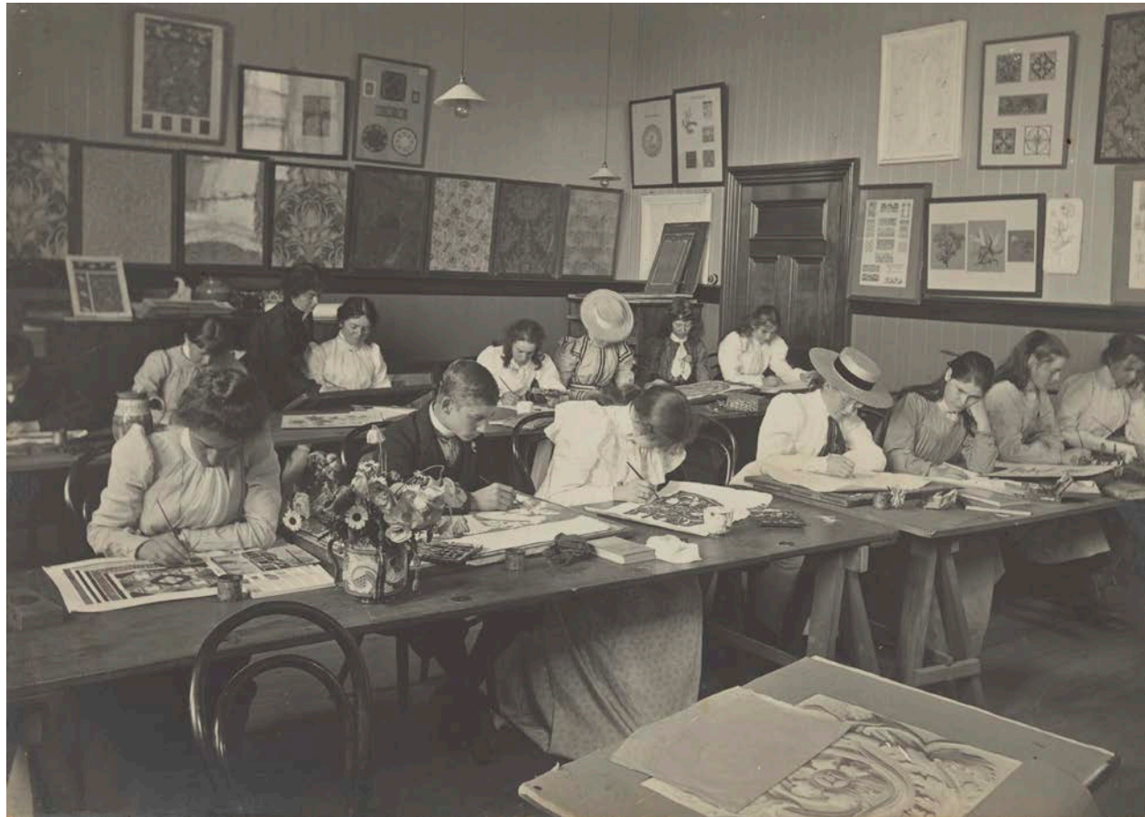
Figure 3: Drawing Class at the Wellington Technical School. Photographer unknown. ca 1897. Alcorn Family: Photographs of Wellington Technical School and Alcorn's Liberty Emporium. Ref: PAColl-3016. Alexander Turnbull Library, Wellington, New Zealand.

Several teachers brought with them some of the necessary publications and examples of good classical and contemporary design which were the basis of the South Kensington