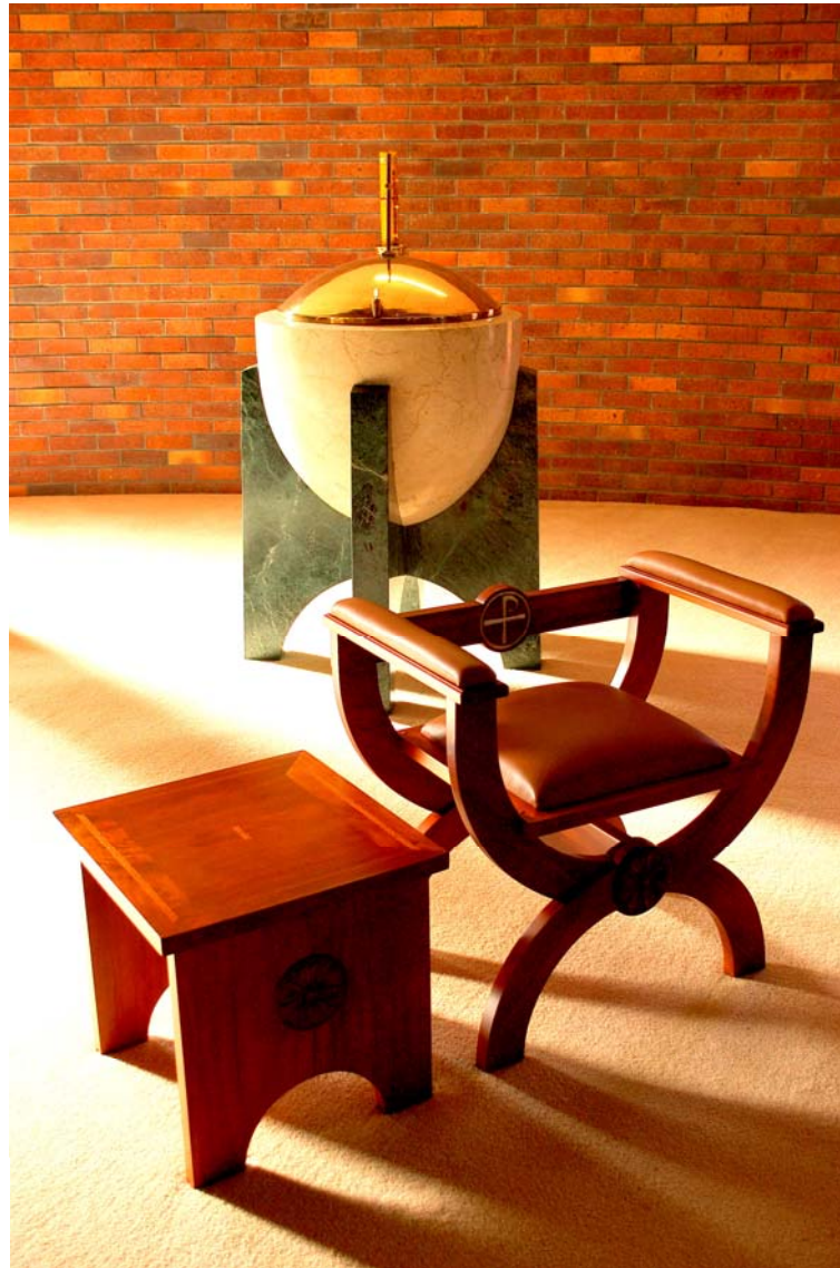
Figure 4: Specialised furniture designed for St Joseph's. J. W. Kellaway (2009)

Father O'Connor wanted not only a modern design but also the interior to be significantly modernised, and to face his parishioners. It was likely an uncomfortable time of change for some parishioners.