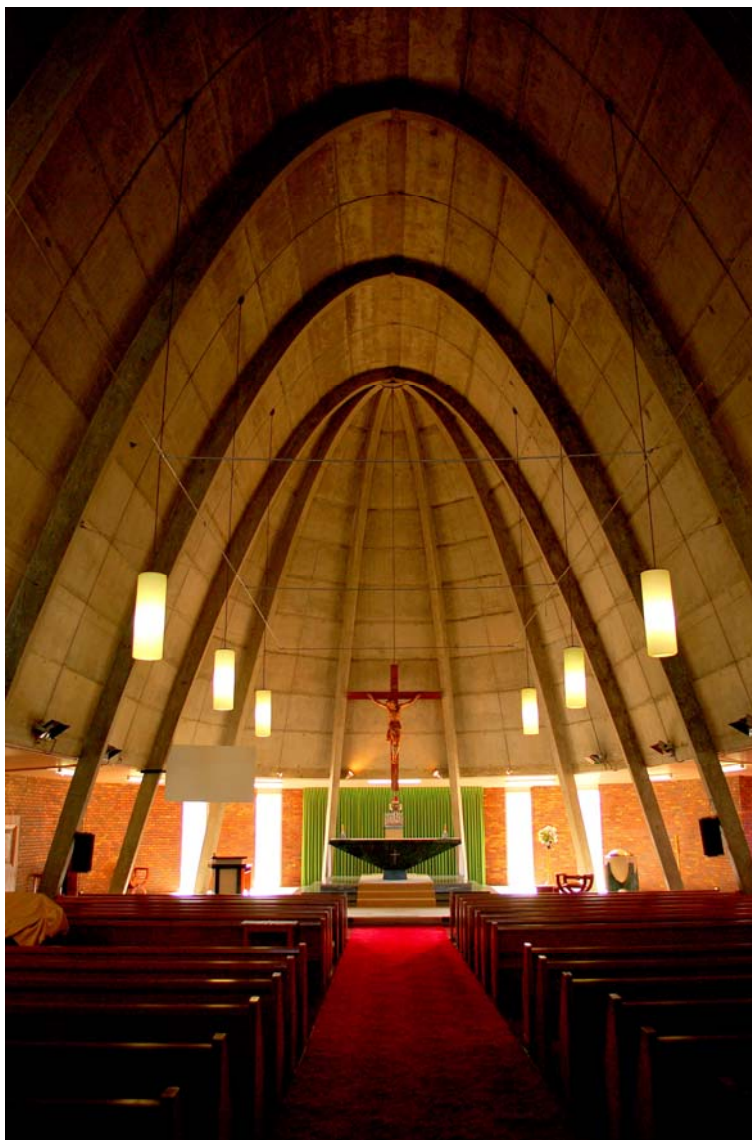
Figure 3: The interior of St Joseph's Church, Morrinsville in 2009. J W Kellaway (2009)

spines became a much softer parabolic form in the final design. In these early sketches for Father O'Connor the altar with large crucifix cross with Christ is the central focus above the altar. In the final construction the symmetry of the interior design was retained by the use of the form, altar. The confession rooms were off to one side, near the side entrance.