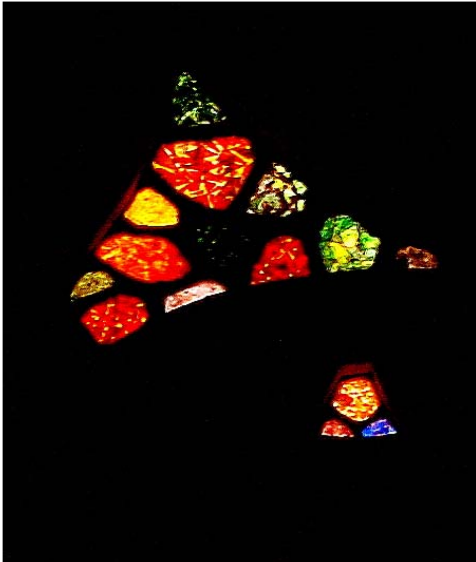
Figure 5 Roestenburg's windows for St Joseph's. J. W. Kellaway (2009)

the lack of funds to complete the works meant essentials were left out during the construction stage such as the waterproofing of the concrete structure which formed the roof and interior. Additional solutions were sought for heating and acoustics and later some waterproofing was applied, but issues remained. 51