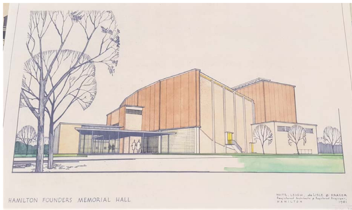
Figure 1: Perspective of Hamilton Founders Memorial Theatre in 1961 by Aubrey de Lisle.

Leigh, de Lisle and Fraser were formally known as the city architects. 13 The firm had begun in the 1930s as Edgumbe and White; they designed the Hamilton Central Post Office, with its grand dome, in 1940. By the