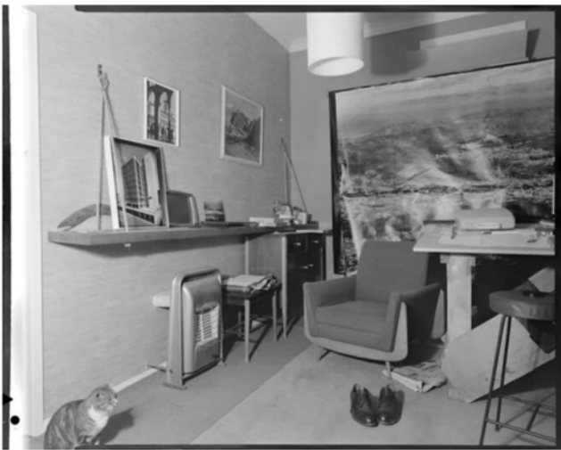
Figure 1: House interior, study.