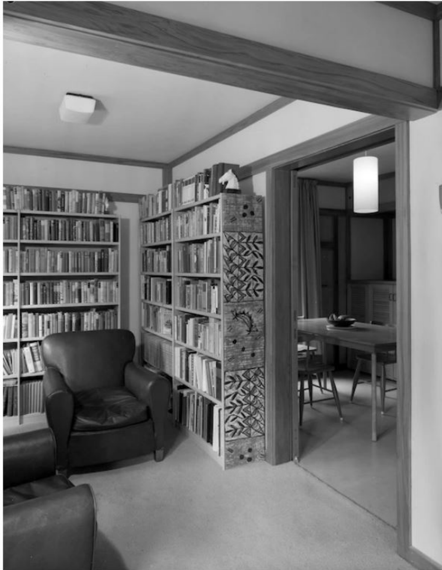
Figure 3: A study adjoining a dining room.