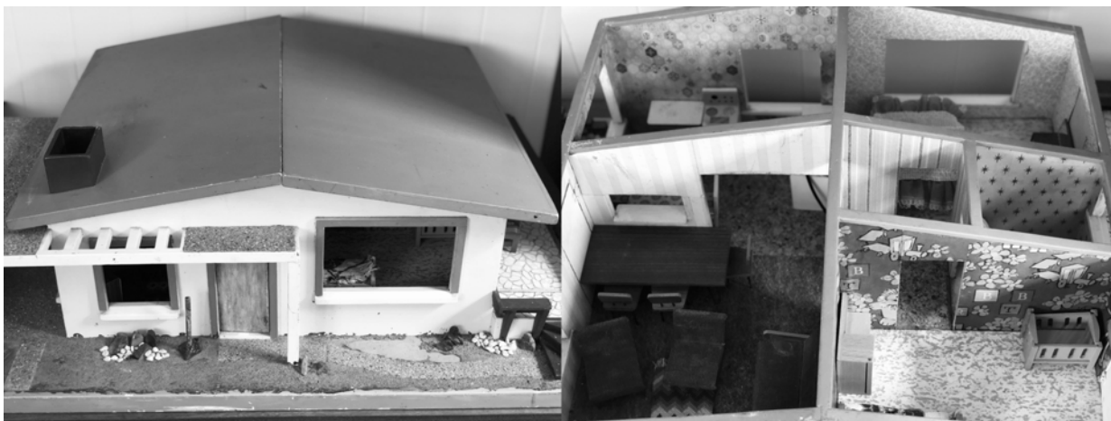
Figure 2: Home-made dolls from the 1960s.

play being a strict analogy with adult life, 41 to Frances Hodgson Burnett's story Rocketty-Packetty House (1906), which is a delightful description of the inhabitants of an abandoned dolls' house having parties and balls, marrying and having families, suffering whooping cough and scarlet fever and dying and being suitably buried, all of which might be acted out in child's play. 42 Given the focus here is on the interior of the 1960s, and particularly that of New Zealand, the three examples offer a useful comparison. The Jomax house looks like a New Zealand house