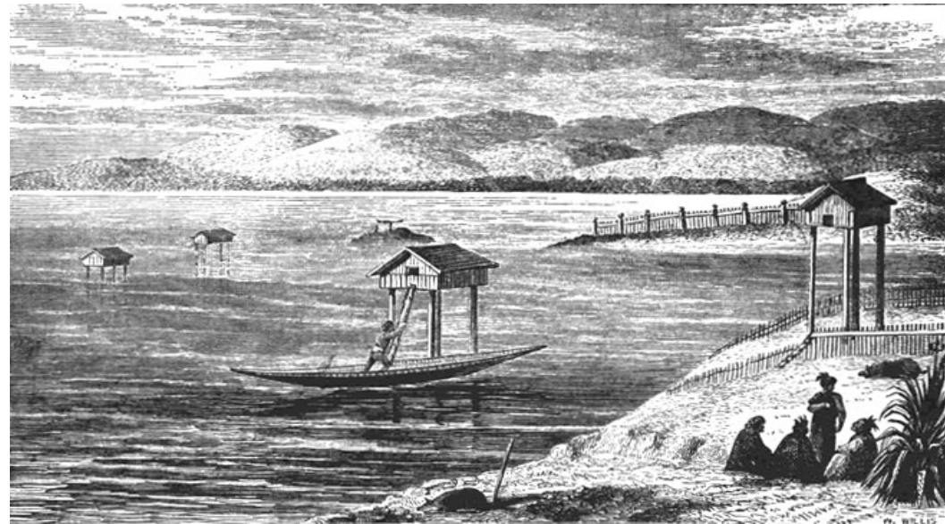
Figure 1: Taylor Te Ika-a-Maui (1870) p 17, republished Adkin "Former Food Stores" p 184.