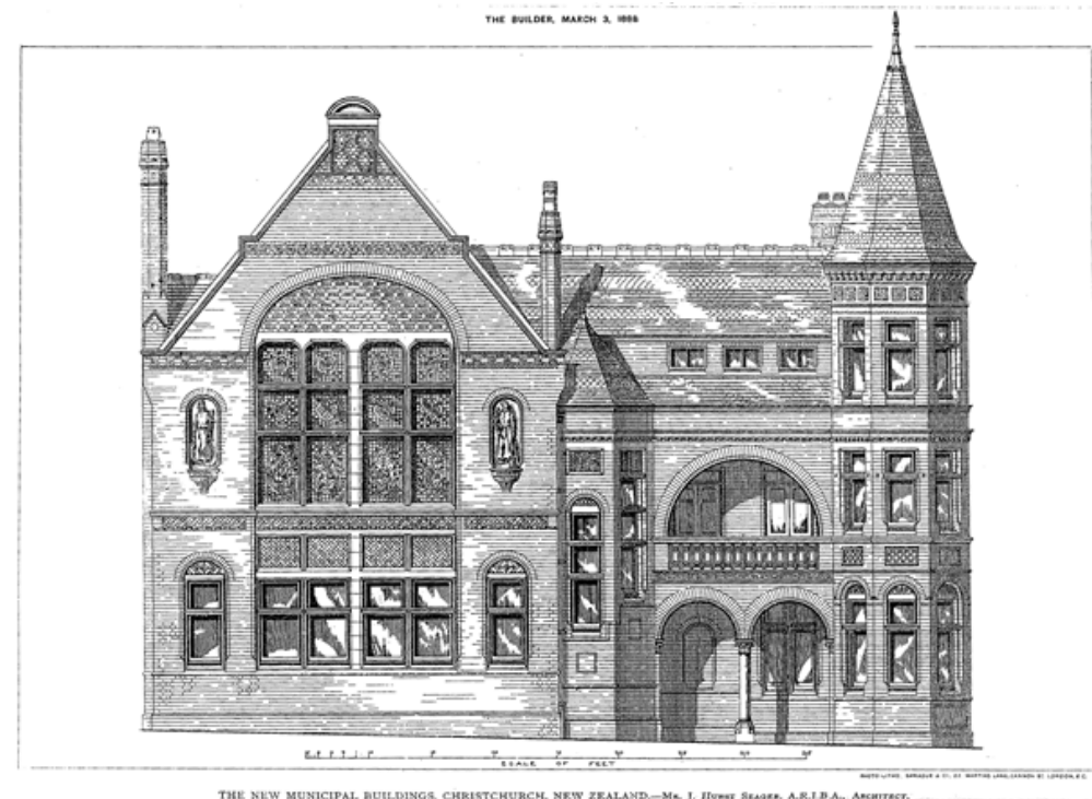
Figure 1: Samuel Hurst Seager, Christchurch Municipal Building, South elevation ( The Builder (3 March 1888): 159).

For nineteenth-century architects the question, "in what style shall we build?" was one of the inescapable problems of the age. As George Gilbert Scott observed, "the peculiar characteristic of the present day, compared with all former periods is this – that we are acquainted with the history of art." 1 Unlike their eighteenth-century predecessors, who were largely content to work within the pre-ordained discipline of the classical style, architects of the Victorian age had at their disposal an almost limitless range of stylistic options that extended beyond the canonical western styles of classical and Gothic to exotic styles ranging from the Arabic to the Indian and Chinese. This diverse range of styles could be employed to express social status, denominational difference, national identity,