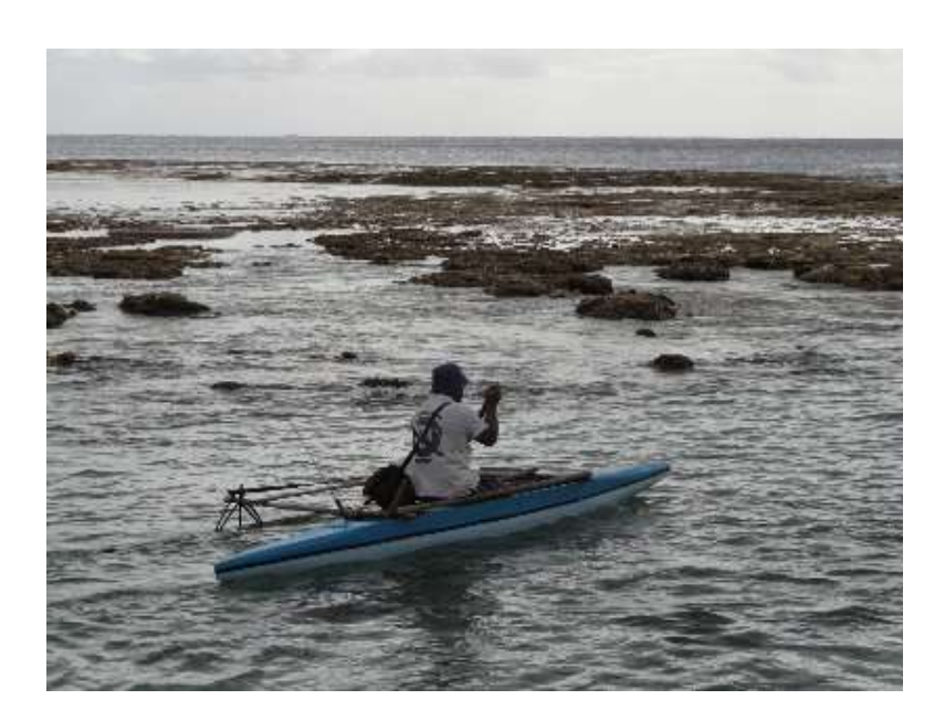
Fig. 11 Robin Kearns, Outrigger Heading Seaward, Avatele, Niue, 2015.

The observation of whales requires patience. And islands, in particular, endorse the art of waiting. A sense of expectation is pervasive. At the hospital, the reception area was a village in itself. No doctor to be seen. And at the airport, baggage handlers had a long break between twice weekly flights, disappearing when not on duty perhaps to mend nets or push out a waka at Avatele. We circled the island daily, the only exit from the wide roundabout that is the island's ring-road being the airport runway. On the seventh day, we found ourselves sitting (just as we had on the flight north) next to the Premier of this not-quite-nation, Toke Tolagi. He was pleased we had found the island to our liking. We discussed some further points of detail in Margaret Pointer's book. From the air, the road was a slender gap in the lush green canopy of pandanus and broadleaf, a cream-white line parting the forest and the sole artery of infrastructure encircling this island of no rivers.