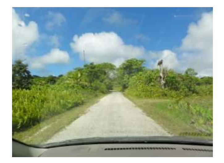
Fig. 6 Robin Kearns, The Ring Road, Niue, 64km the Return Trip, 2015.

In the 1800s, Pointer relates, the punishment for serious law-breaking—crimes such as theft, adultery, and working on the Sabbath—was road building. Working with the harsh fossilised coral makatea was considered a lesser punishment than detention in one of the island's many caves—an exile gravely feared for the evil spirits believed to be dwelling within. The duration spent on road-building was calibrated according to the offense. "It was obviously a punishment that was liberally administered," writes Pointer, for, by 1859, there was "a road six feet wide right around this island, fringed with coconut trees for shade."<sup>4</sup> This, she writes, was pleasing to George Turner, of the London Missionary Society, who wrote, in his memoir Nineteen Years in Polynesia , that "a missionary will find this road a great facility for his labours as it will enable him to take a horse all around the island."<sup>5</sup> The quest for smooth passage around Niue later led Christopher Maxwell, resident commissioner from 1904, to make road improvements a priority of his tenure, "to render the road around the island smooth and suitable for wheeled vehicles or bicycles."<sup>6</sup> Non-convict workers, Pointer notes, were paid in food and tobacco according to length of road worked on.