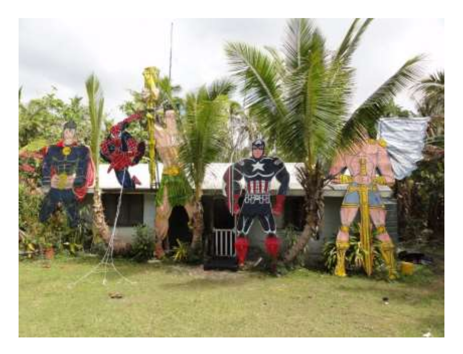
Fig. 9 Robin Kearns, Roadside Superheroes, Niue, 2015.

Driving north of Liku late one afternoon—what day was it? I have no memory; naming days seemed of little consequence—we spoke of childhoods; the way parents once were heroes, looming large and then how, one day, we wake and they are suddenly bathed in new light, foibles exposed to a different gaze. It was the sort of korero that seldom happens in ordinary life; it takes an island, a roadway and maybe its adjacent graves to bring to the surface talk of decline and lives that, like this road, come full circle.