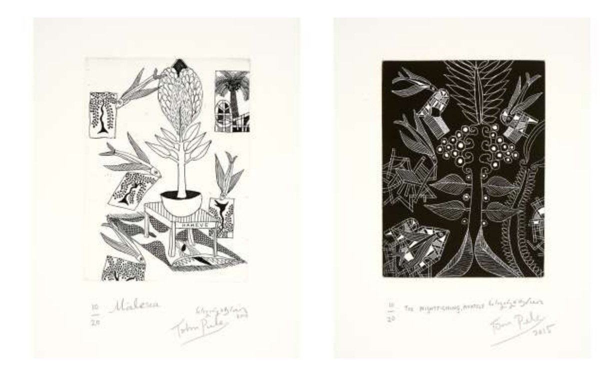
Fig. 3 John Pule and Gregory O'Brien, Maleva , 2015, intaglio etching, c.260x220mm, courtesy of the artists.

Amidst a seemingly random array of shipping containers beside the Liku Rd, a fish merchant called Graeme sells me a bag of ten flying fish ( hahave , in Niuean) after explaining, not entirely convincingly, the traditional use of the fish: Niueans tend to eat them in the late morning, he stipulates, when they are suffering from massive hangovers. Fresh from the freezer, the flying fish are carried down to the sea. The afflicted person holds the fish in the tropical water and, as it defrosts, the skin is peeled back. And the fish is eaten raw. And, this way, even the roughest of hangovers is swiftly cured.