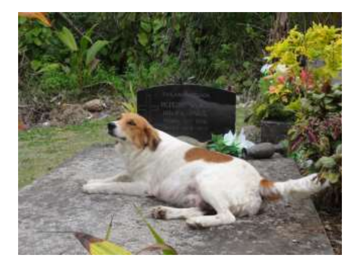
Fig. 8 Robin Kearns, Roadside Grave with Attendant, Niue, 2015.

Everything of note seemed on or very near to the ring road: graves, churches, paths to the sea. One of the lasting images was of a dog lying on an elevated grave adjacent to the Catholic Church. There seemed no disrespect. The dog had a knowing smile, in the way some dogs do. It was as if she was keeping a lost master warm. That scene made me think of the 70s band Three Dog Night, named for an aboriginal tradition whereby status was accorded to whomever had the most dogs to keep them warm through the desert night. On this grave, I guessed the silent sleeper would be grateful for a dog by day. Gratitude. Niue seemed an island on which to give thanks for elevation, for height above rising seas, for expectations of eventual returns to emptied houses, of risings from the dead. Or so it seemed each time we saw more roadside graves bearing silent witness to we who passed each day. They also seemed to know that on the seventh day we'd leave.